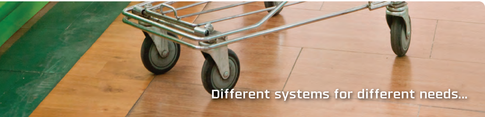
Different systems for different needs...