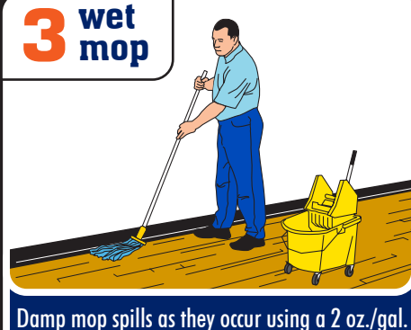
dilution of Blue Concentrate (2085FC). Avoid saturating the floor with cleaner solution.

Carefully remove gum, tape and labels with a putty knife. Angle the blade so you don't damage the finish.