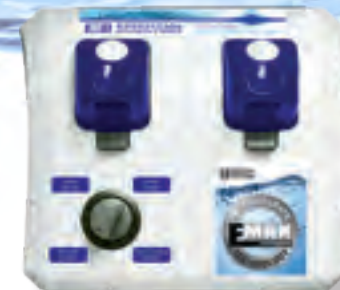
EQEMAX1X1 Dial-Button 4P/1P