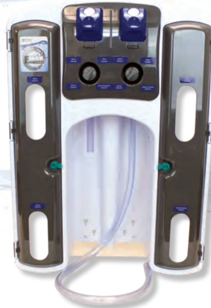
EQEMAX4X4CB EMax 4P

4 products, 1 accurate technology. Countless opportunities to customize.