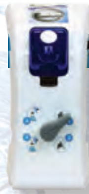
EQEMAX4 Single-Dial 4P