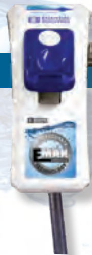
EQEMAX1 Single-Button 1P

EMax dispensers deliver increased durability and easy, tool-free maintenance with compact profiles that can easily be mounted anywhere.