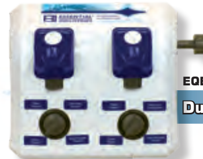
EQEMAX4X4 Dual-Dial 4P/4P