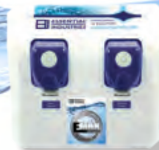
EQEMAX1X1 Dual-Button 1P/1P