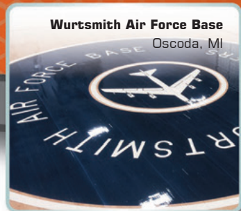
Wurtsmith Air Force Base Oscoda, MI