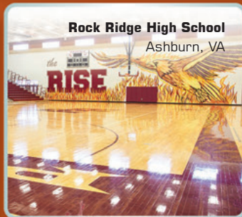
Rock Ridge High School Ashburn, VA