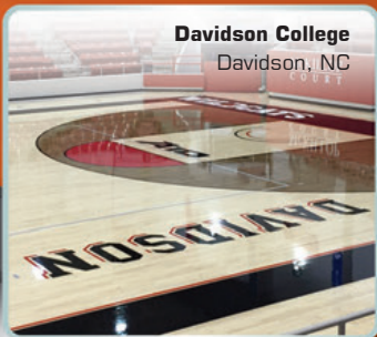
Davidson College Davidson, NC