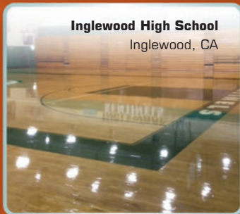
Inglewood High School Inglewood, CA